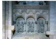
Apostelreliefs der Georgenchorschränke Bildarchiv Foto Marburg Athena