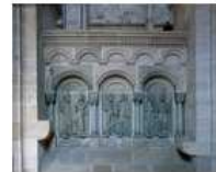
Apostelreliefs der Georgenchorschränke Bildarchiv Foto Marburg Athena