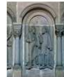
Apostelreliefs der Georgenchorschränke Bildarchiv Foto Marburg Athena