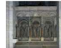
Apostelreliefs der Georgenchorschränke