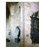
Epitaph für Fürstbischof