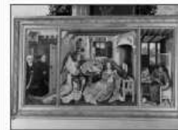
Aufnahme-Nr. 199.535;; Aufn.-Datum: 1942/1943;

Abb. in anderen Microfiche-Publikationen: WIT,12302,F,6-12303,C,4