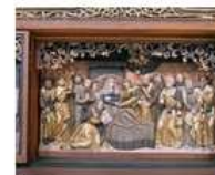
Kirchgattdorfer Altar &