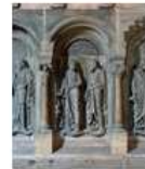
Apostelreliefs der Georgenchorschränke Bildarchiv Foto Marburg Athena